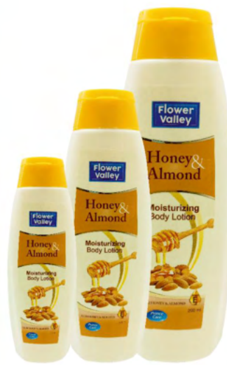
Rich Honey & Almond